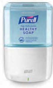
PURELL ES8 ENERGY ON REFILL SMARTLINK™ CAPABILITY