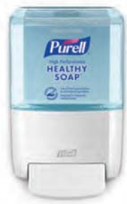
PURELL ES4 PUSH-STYLE