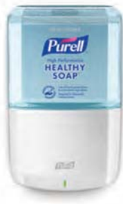
PURELL ES6 TOUCH-FREE